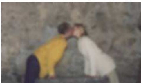
Does this stolen photo represent a 14-year old kiss?

How is it done? In short, it is just lip touching. In long, well, it's too long to explain, because until you get there, there is a VERY long process.